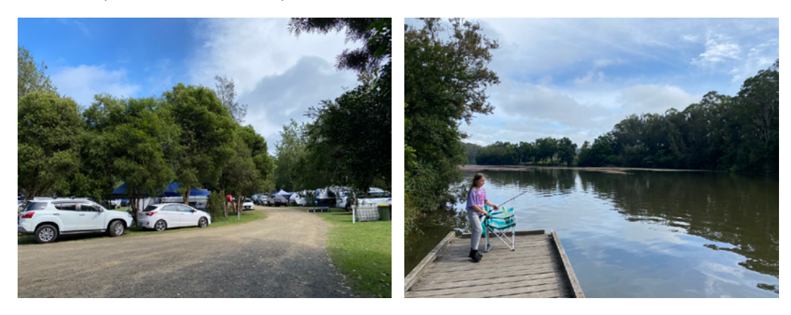
Clarence River Campground

The fog clears to a beautiful sunny autumn day. We have a cuppa in town in a quaint café named The Barn. On the way home we call in at the Clarence River Campground, thinking it may be a great place for future trips. It is indeed a lovely campground next to the river, with trees and grassy areas and fishing platforms set on the edge of the river. Predictably, it too, is full of campers this weekend.