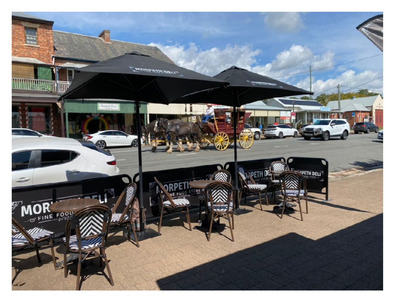
Look what was going down the main street of Morpeth

We have a trouble-free trip home. Thanks Troy and Sandi for putting the run up as an option for Easter. It was great to get away for the weekend and do something a little different.