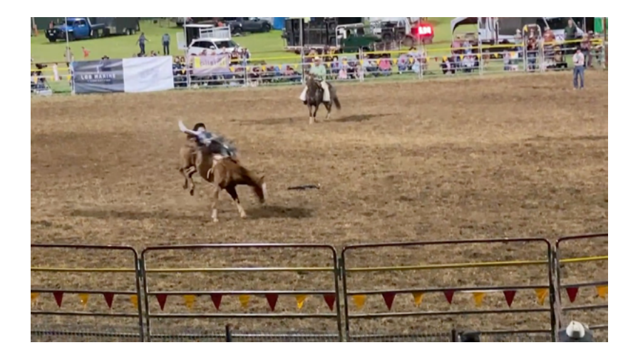
Bareback riding – the craziest

The lady next to me worries about the horse falling, telling me they are very likely to snap a tendon if they fall. She says these horses have not been broken in and they buck because they have a flank strap tied around them. The flank strap is also what makes the bulls buck, as they try to kick free of it.