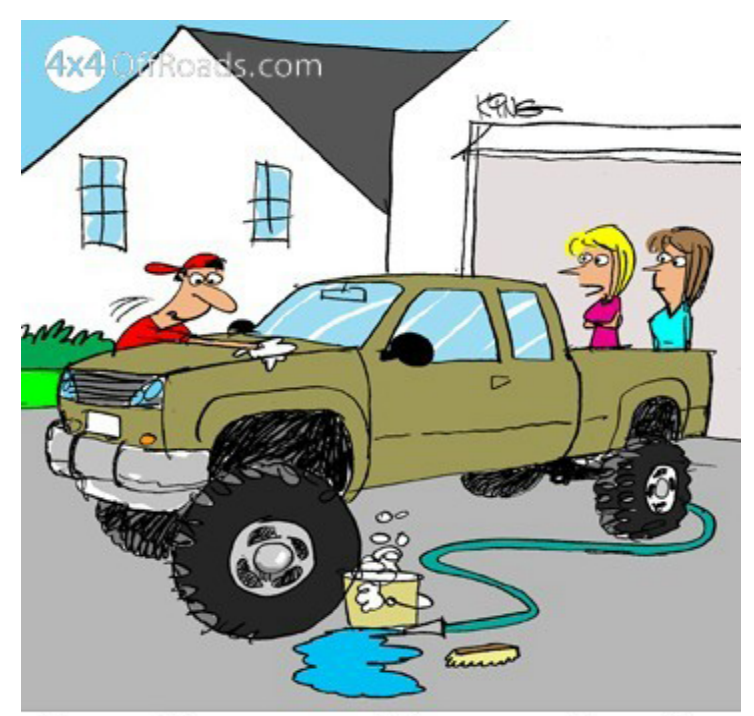
"I actually encourage him to go off-roading. Cleaning his truck is the only exercise he gets."

When you think you have found the secret destination, email me at s_bennett51@outlook.com with your location. If you have visited this location, send a photo and/or write a few paragraphs of your visit there, or a funny experience you may have had there and what you liked/disliked about the place. There is no prize.